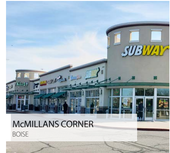
McMILLANS CORNER BOISE

153,233 SF Multitenant Retail Center Landlord Representation 2019-Present