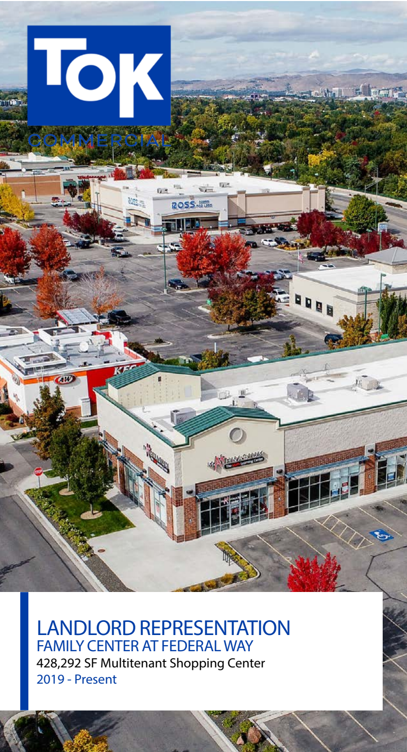
LANDLORD REPRESENTATION FAMILY CENTER AT FEDERAL WAY 428,292 SF Multitenant Shopping Center 2019 - Present