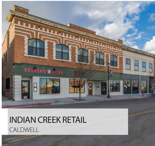
INDIAN CREEK RETAIL CALDWELL