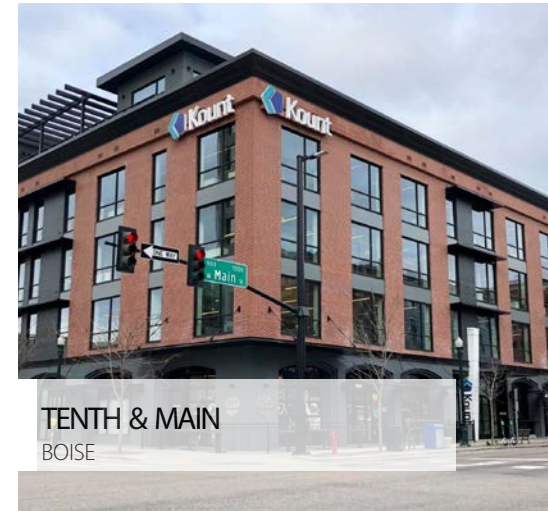
TENTH & MAIN BOISE

Retail Space in the Heart of Downtown Boise September 2022 - Present