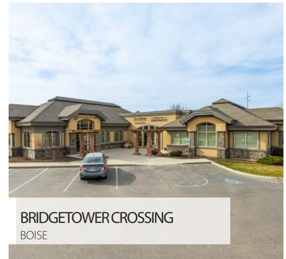
BRIDGETOWER CROSSING BOISE

Lease-Up to Investment Sale Landlord/Seller Representation 10,000 SF Retail Center