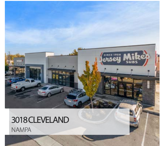
3018 CLEVELAND NAMPA

Lease-Up to Investment Sale Landlord/Seller & Tenant Representation 17,000 SF Retail Center | Six Tenants