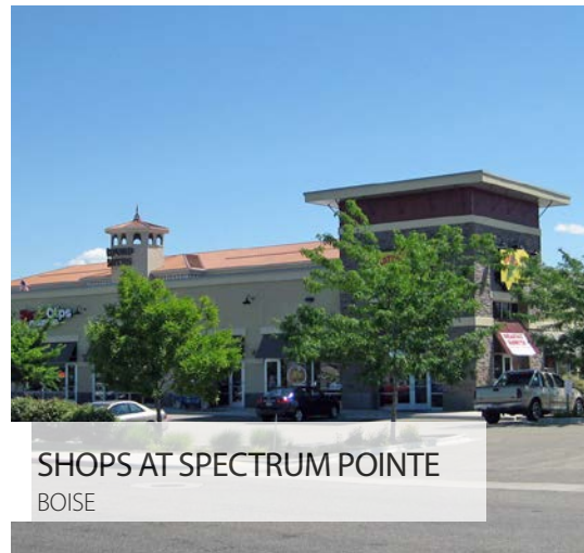
SHOPS AT SPECTRUM POINTE BOISE

Lease-Up to Investment Sale Landlord/Seller & Tenant Representation 2019-2024