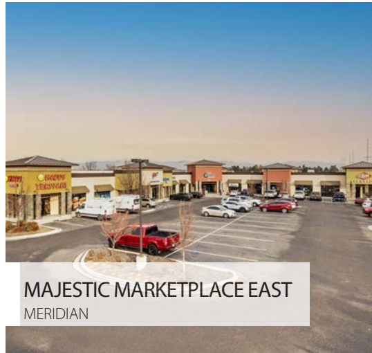
MAJESTIC MARKETPLACE EAST MERIDIAN

Lease-Up to Investment Sale Landlord/Seller & Tenant Representation 12,210 SF Historic Retail Building | Three Tenants