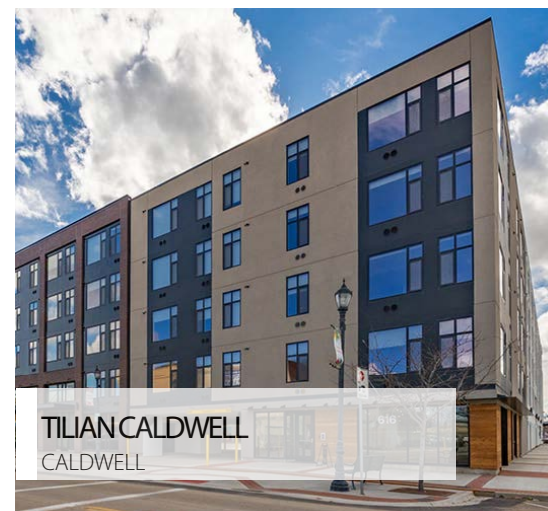
TILIAN CALDWELL CALDWELL

(20+) New leases on Primary DT Retail Block 2013 - 2023