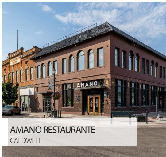
AMANO RESTAURANTE CALDWELL

Lease-Up to Investment Sale Landlord/Seller & Tenant Representation 5,500 SF Retail Strip | Four Tenants