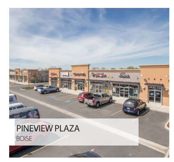
12,000 SF Multitenant Strip Center Landlord Representation 2019-Present