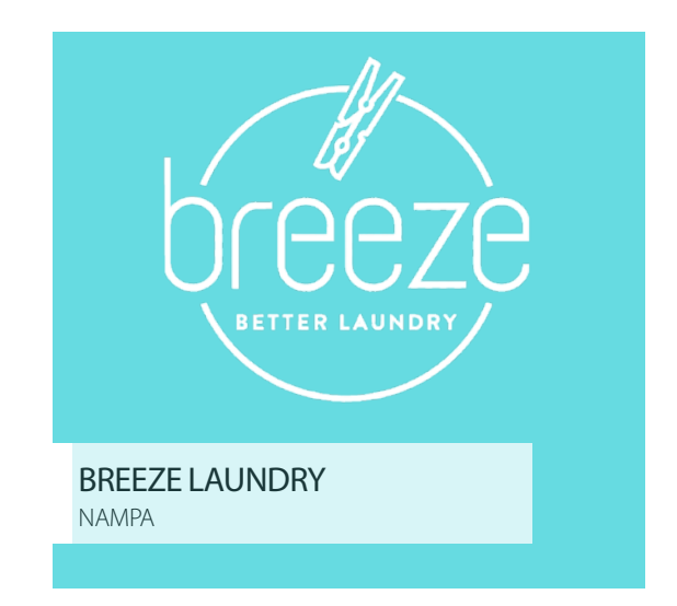
Leased 3,450 SF at District 20 Tenant Representation October 2022