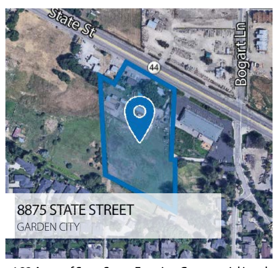
4.82 Acres of State Street Fronting Commercial Land Seller Representation Present