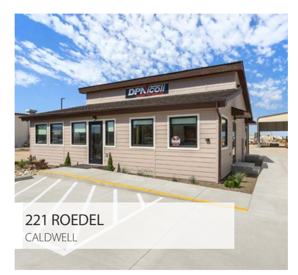
Single Tenant, Industrial Investment Property Buyer Representation August 2022