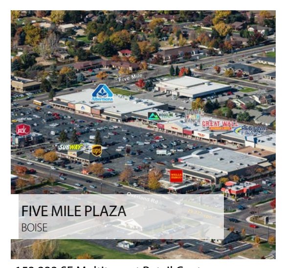
153,233 SF Multitenant Retail Center Landlord Representation 2019-Present

(208) 947-0852 | jpgreen@tokcommercial.com