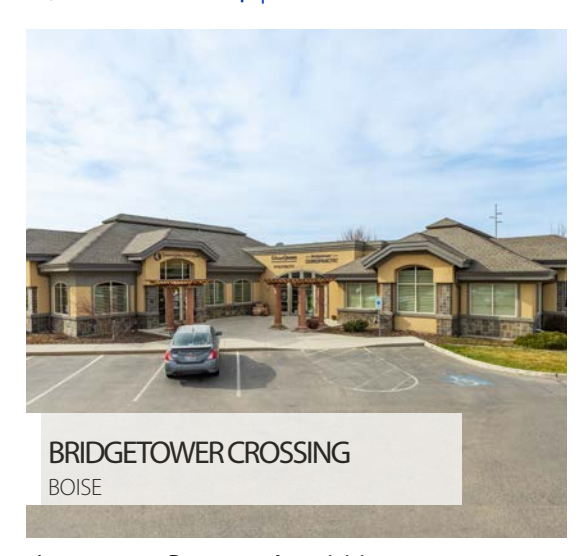
Investment Property Acquisition Buyer Representation Fully-Leased, Multi-Tenant Office Investment