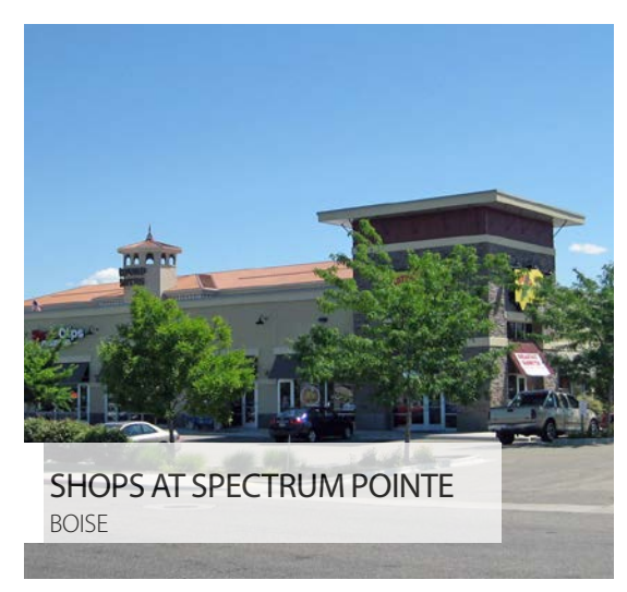
Lease-Up to Investment Sale Landlord/Seller Representation 10,000 SF Retail Center