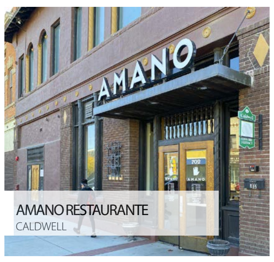
Tenant Representation Local restaurant in Historic DT Caldwell April 2019