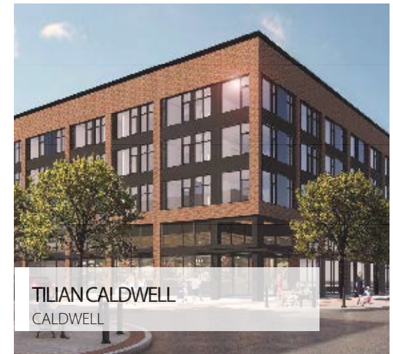
TILIAN CALDWELL CALDWELL

Landlord Representation (20+) New leases on Primary DT Retail Block 2013 - Present