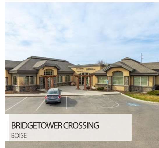
BRIDGETOWER CROSSING BOISE

Lease-Up to Investment Sale Landlord/Seller Representation 10,000 SF Retail Center