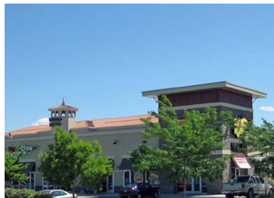
SHOPS AT SPECTRUM POINTE BOISE

Lease-Up to Investment Sale Landlord/Seller & Tenant Representation 5,500 SF Retail Strip | Four Tenants