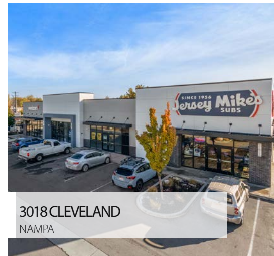
3018 CLEVELAND NAMPA

Lease-Up to Investment Sale Landlord/Seller & Tenant Representation 17,000 SF Retail Center | Six Tenants