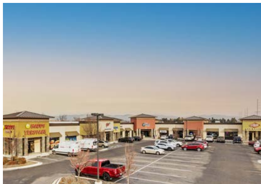
MAJESTIC MARKETPLACE EAST MERIDIAN