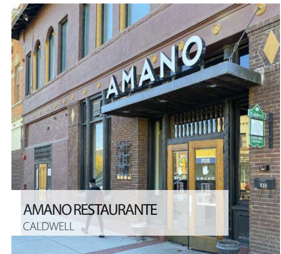
AMANO RESTAURANTE CALDWELL

Landlord Representation Retail Space in the Heart of Downtown Boise September 2022