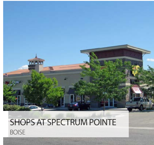
SHOPS AT SPECTRUM POINTE BOISE

Lease-Up to Investment Sale Landlord/Seller & Tenant Representation 5,500 SF Retail Strip | Four Tenants