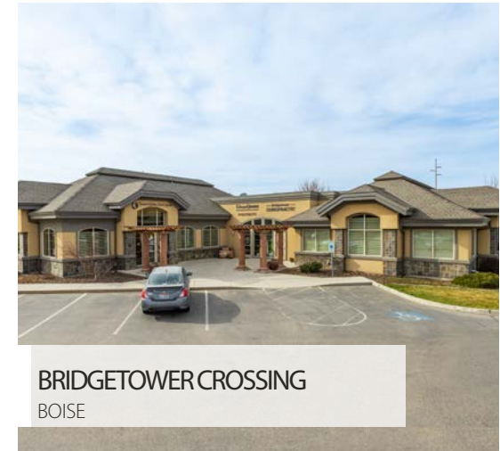
BRIDGETOWER CROSSING BOISE

Lease-Up to Investment Sale Landlord/Seller Representation 10,000 SF Retail Center