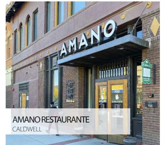
AMANO RESTAURANTE CALDWELL

Landlord Representation Retail Space in the Heart of Downtown Boise September 2022