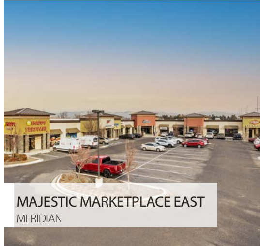
MAJESTIC MARKETPLACE EAST MERIDIAN