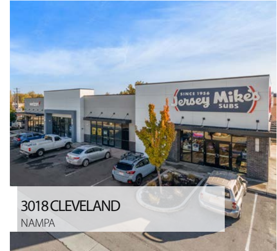
3018 CLEVELAND NAMPA

Lease-Up to Investment Sale Landlord/Seller & Tenant Representation 17,000 SF Retail Center | Six Tenants