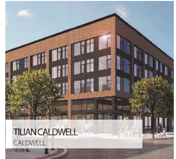
TILIAN CALDWELL CALDWELL

Landlord Representation (20+) New leases on Primary DT Retail Block 2013 - Present