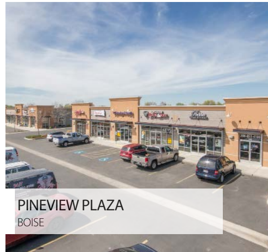
PINEVIEW PLAZA BOISE

13,175 SF Multitenant Retail Center Landlord Representation 2019-Present