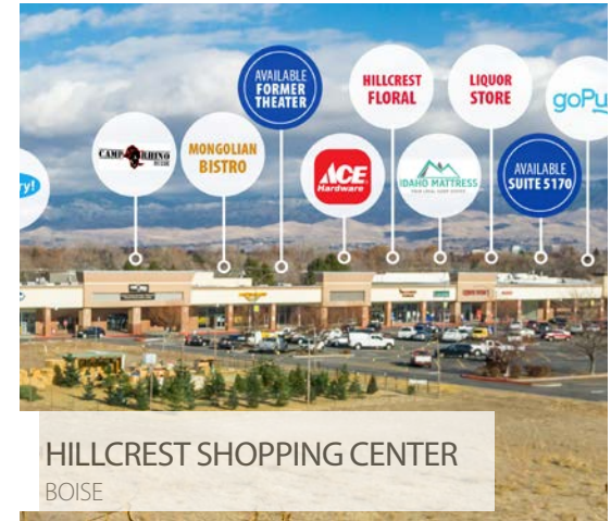
HILLCREST SHOPPING CENTER BOISE

Landlord Representation 59,839 SF multitenant strip center From 50% vacant to 100% occupied