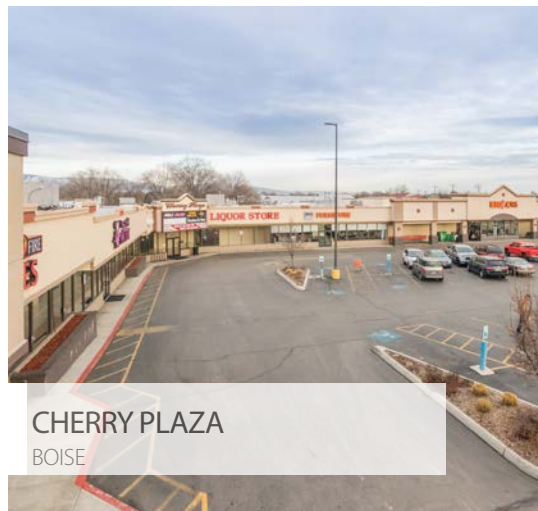
CHERRY PLAZA BOISE

Owner | Landlord Representation 168,693 SF multitenant strip center Revitalization of 30% vacant property