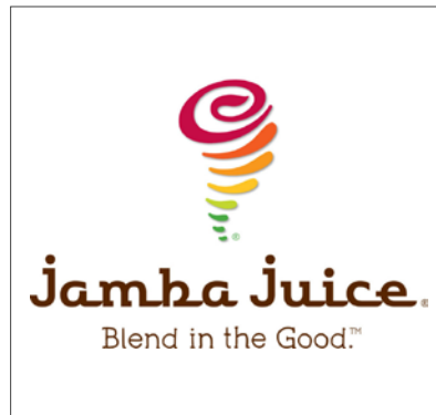
Tenant Representation National Retailer Site Selection