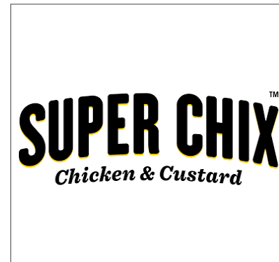
Tenant Representation National Retailer Site Selection