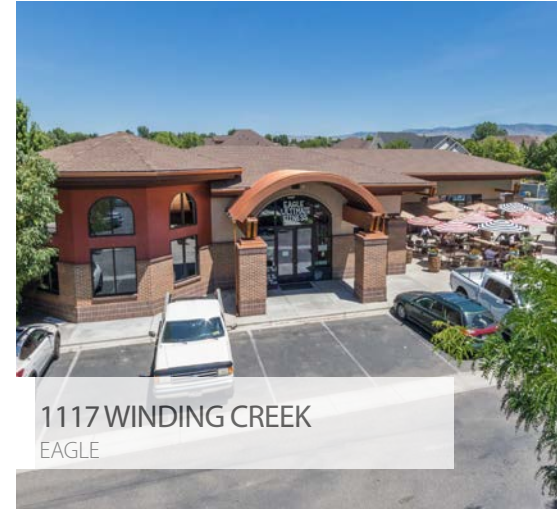
1117 WINDING CREEK EAGLE

Seller Representation Multitenant Retail Strip Center Investment Sale