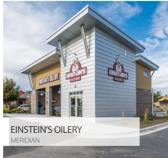
EINSTEIN'S OILERY MERIDIAN

Seller Representation Multitenant Retail Strip Center Investment Sale