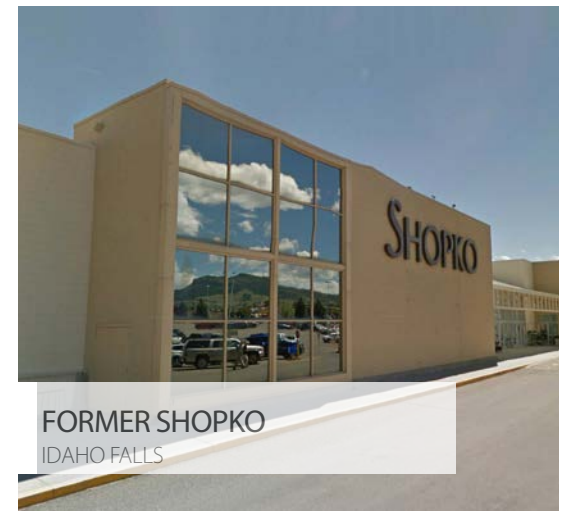
FORMER SHOPKO IDAHO FALLS

Landlord Representation 113,970 SF multi-tenant strip center 4 leases | 15,000 SF filled | 85% occupied