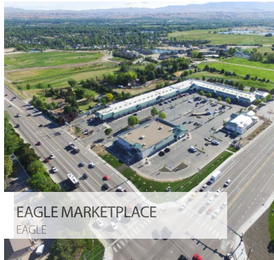
EAGLE MARKETPLACE EAGLE

(208) 947-0827 | holly@tokcommercial.com