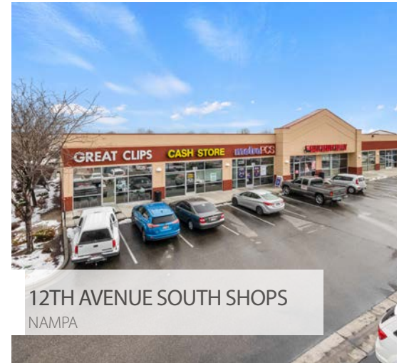
12TH AVENUE SOUTH SHOPS NAMPA

Buyer Representation Single tenant, NNN leased investment 4 - Investment Sale(s) & Lease-back