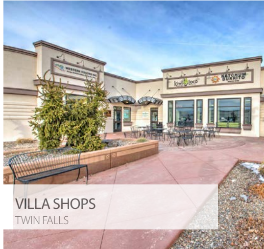
VILLA SHOPS TWIN FALLS

(208) 947-0827 | holly@tokcommercial.com