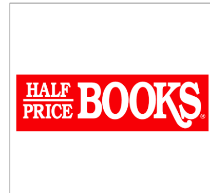
Tenant Representation National Fitness Retailer Site Selection