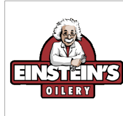
Tenant Representation Regional Retailer Site selection