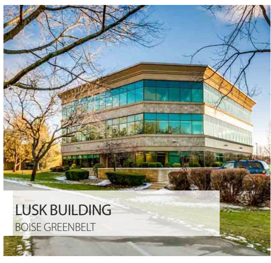
Tenant Representation - 8,897 SF OFFICE