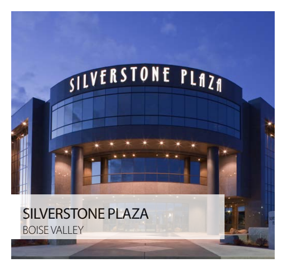
Tenant Representation - 5,941 SF OFFICE