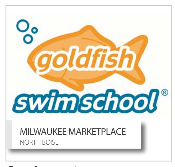
Tenant Representation 10,109 SF RETAIL