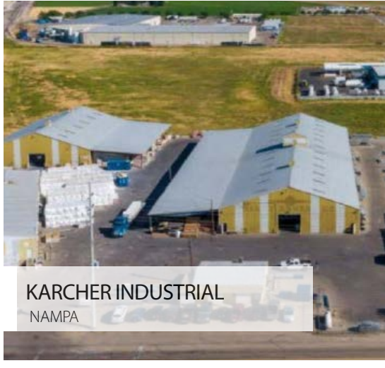
Buyer Representation 56,320 SF INDUSTRIAL