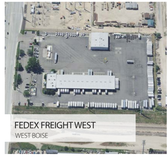
Buyer Representation 32,000 SF INDUSTRIAL

Phone: (208) 947-0802 | nick@tokcommercial.com