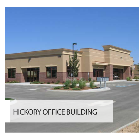
Buyer Representation 7,456 SF OFFICE