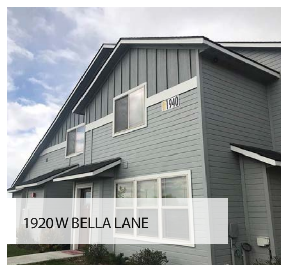
Buyer Representation 16 Units | 15,440 SF MULTIFAMILY

Phone: (208) 947-0802 | nick@tokcommercial.com