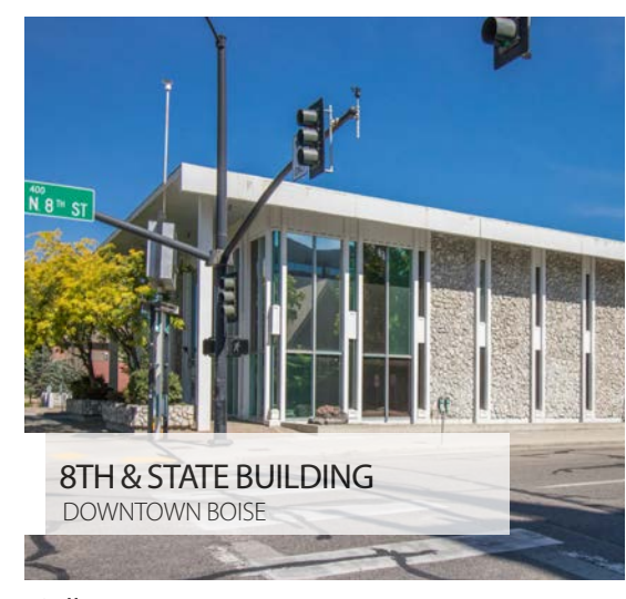
Seller Representation 10,843 SF OFFICE