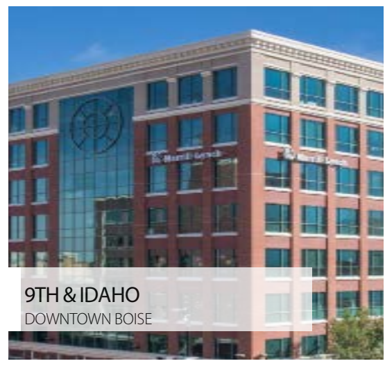
Landlord Representation OFFICE