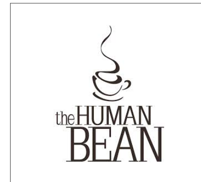
National Coffee Retailer 2 units opened | 2005 - Present