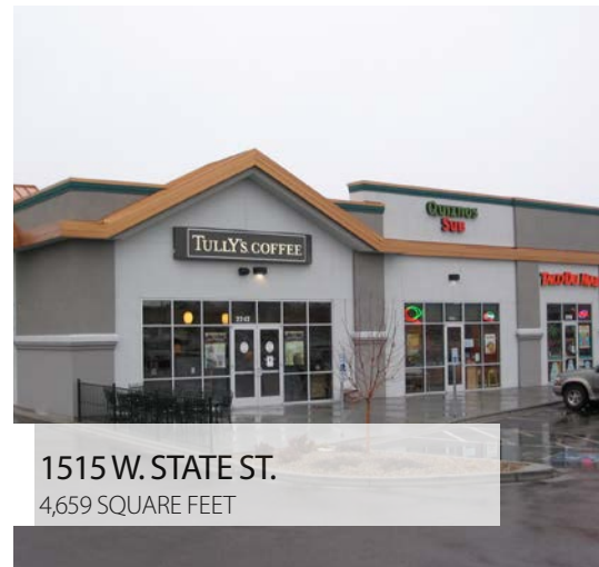
1515 W. STATE ST. 4,659 SQUARE FEET

Owner Representation Multitenant Retail Shopping Center Investment Sale