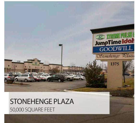
STONEHENGE PLAZA 50,000 SQUARE FEET

Owner Representation Retail Shops Investment Sale