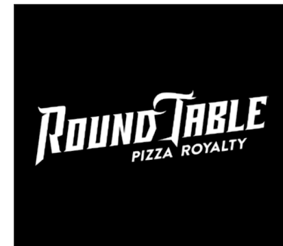
National Restaurant 4 units opened | 1998-Present