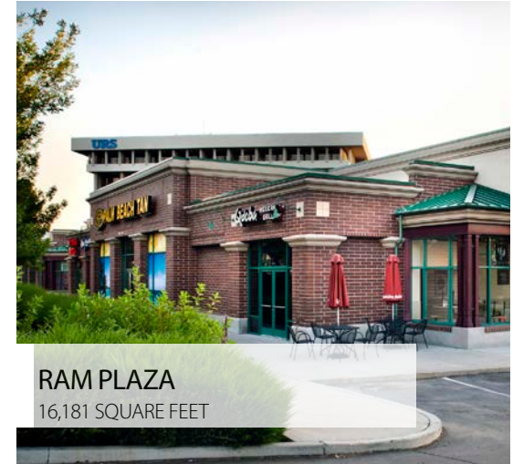
RAM PLAZA 16,181 SQUARE FEET

Buyer & Owner Representation Multitenant Retail Shopping Center Disposition & Purchase