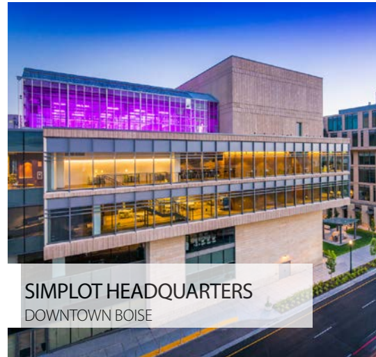
SIMPLOT HEADQUARTERS DOWNTOWN BOISE

Phone: (208) 947-0817 | marks@tokcommercial.com