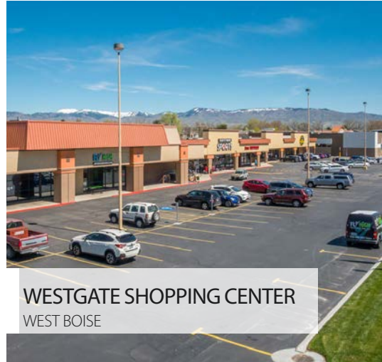
WESTGATE SHOPPING CENTER WEST BOISE

Phone: (208) 947-0817 | marks@tokcommercial.com