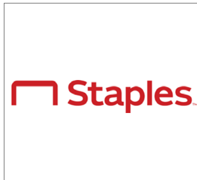
National Retailer Present