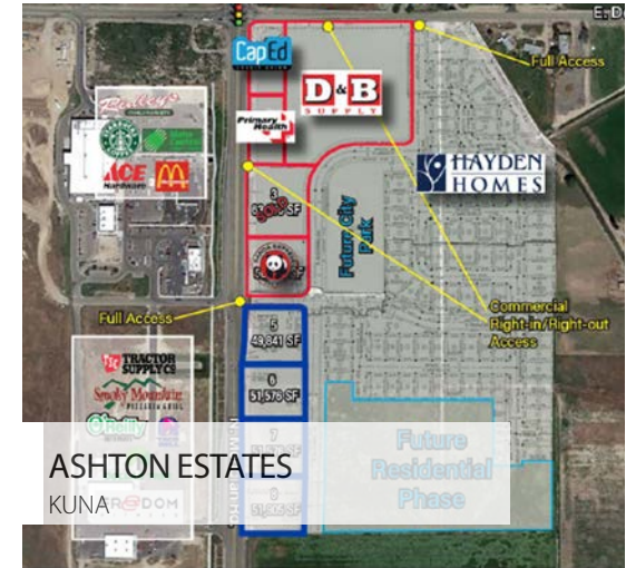
ASHTON ESTATES KUNA

7,500 SF Restaurant Lease | Anthony's Landlord Representation April 2019