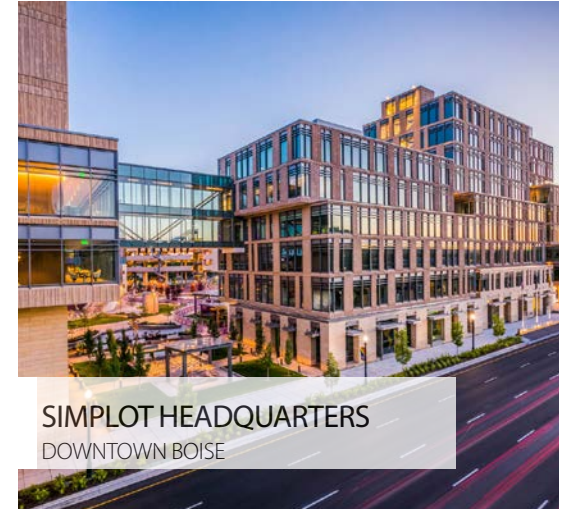
SIMPLOT HEADQUARTERS DOWNTOWN BOISE

Landlord Representation 67,000 SF Multitenant Shopping Center 2001-Present