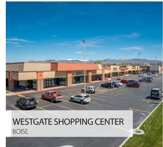
WESTGATE SHOPPING CENTER BOISE

Retail Branch Renewal | Karcher Mall | Nampa Tenant Representation December 2018