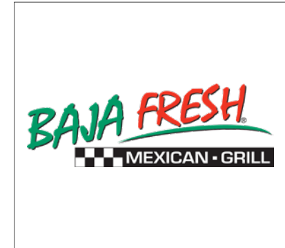
National Restaurant 3 units opened | Boise & Meridian