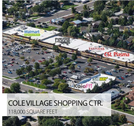
COLE VILLAGE SHOPPING CTR. 118,000 SQUARE FEET

Phone: (208) 947-0817 | marks@tokcommercial.com