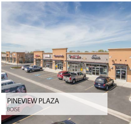
PINEVIEW PLAZA BOISE

13,175 SF Multitenant Retail Center Landlord Representation 2019-Present