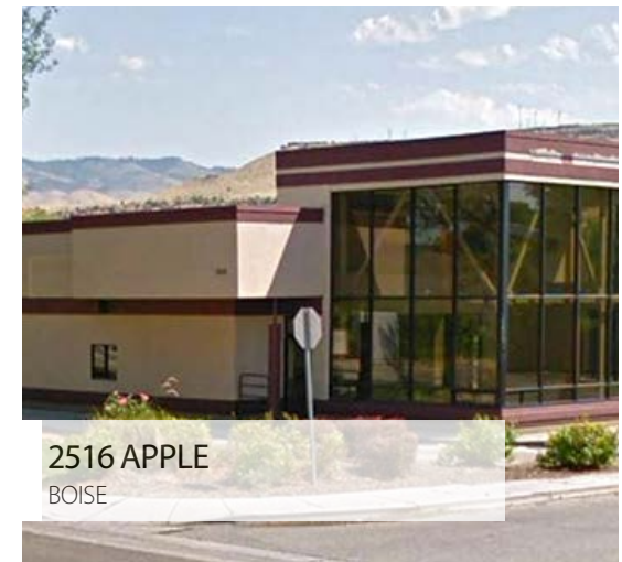
2516 APPLE BOISE

4,591 SF Single Tenant Office | Retail Building Buyer Representation January 2020