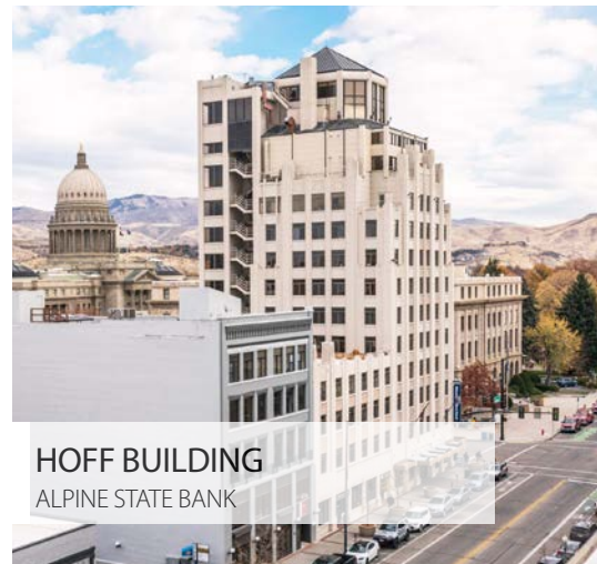
HOFF BUILDING ALPINE STATE BANK

3,735 SF Freestanding Retail with Drive-Thru Buyer Representation January 2020