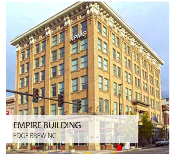
EMPIRE BUILDING EDGE BREWING

Tenant Representation New Lease November 2019