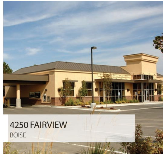
4250 FAIRVIEW BOISE

(208) 947-0852 | jpgreen@tokcommercial.com