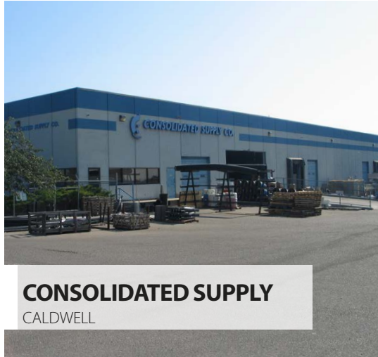
CONSOLIDATED SUPPLY CALDWELL

Tenant Representation Single Tenant Office Building 34,750 SF Leased