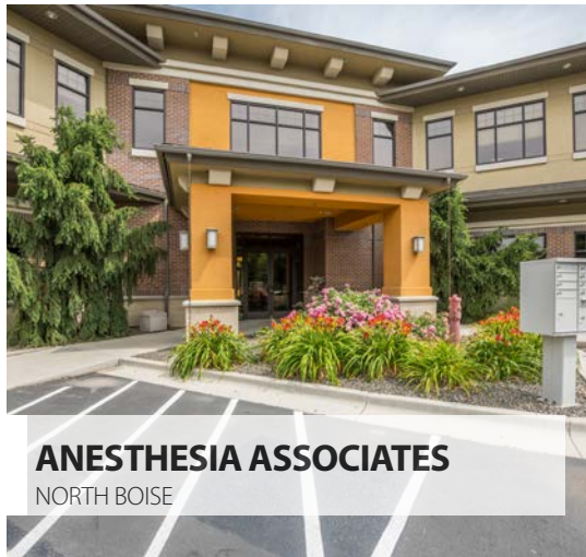
ANESTHESIA ASSOCIATES NORTH BOISE

Tenant Representation Multi-tenant office building 24,742 SF Leased