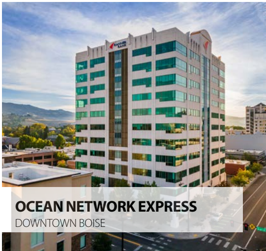
OCEAN NETWORK EXPRESS DOWNTOWN BOISE

Tenant Representation Single Tenant Industrial Building 35,000 SF Leased