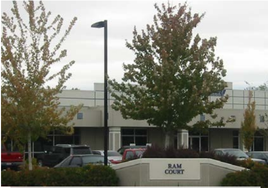
TAOS MOUNTAIN LLC (RAM COURT) SOUTHWEST BOISE

Tenant Representation Single Tenant Office Building 34,750 SF Leased