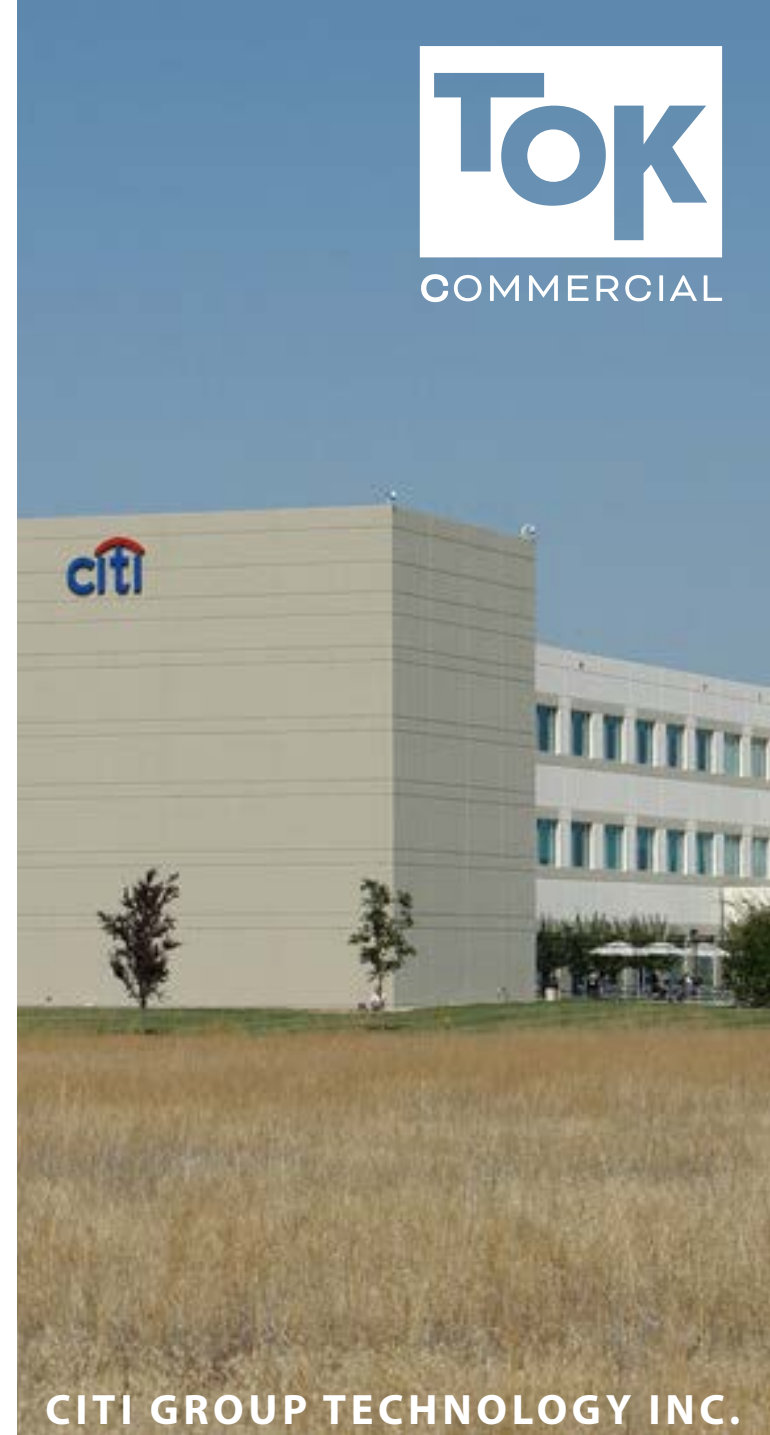
CITI GROUP TECHNOLOGY INC.

Buyer Representation Multi-condo office building 6,633 SF Purchase