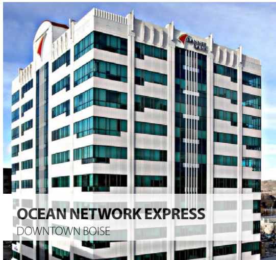
OCEAN NETWORK EXPRESS DOWNTOWN BOISE

Tenant Representation Single Tenant Industrial Building 35,000 SF Leased