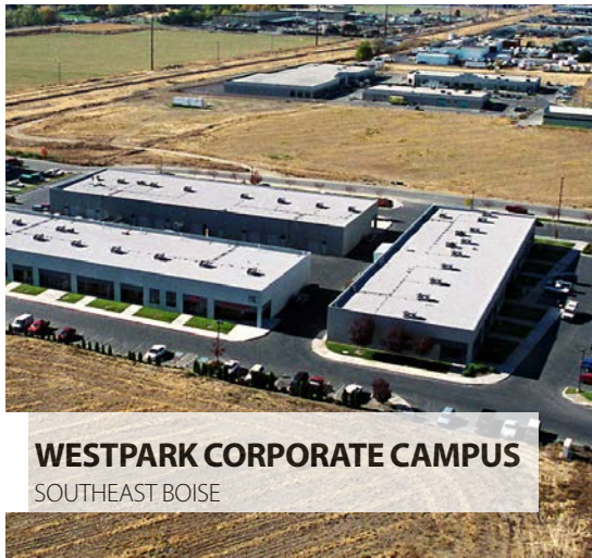
WESTPARK CORPORATE CAMPUS SOUTHEAST BOISE

Landlord/Seller Representation since 2005 Multitenant Office Building 26,040 SF | 2 stories 30+ leases and renewals | 98% occupancy | Sold in 2020