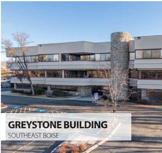
GREYSTONE BUILDING SOUTHEAST BOISE

Landlord Representation since 2018 Multi-tenant Office Building 33,378 SF | 3 stories 15,000 SF leased | 100% occupancy in 2020