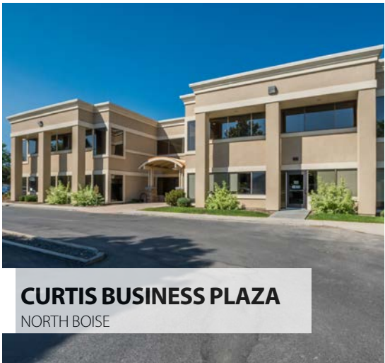
CURTIS BUSINESS PLAZA NORTH BOISE

Landlord Representation since 2018 Multi-tenant Office Building 33,378 SF | 3 stories 15,000 SF leased | 100% occupancy in 2020