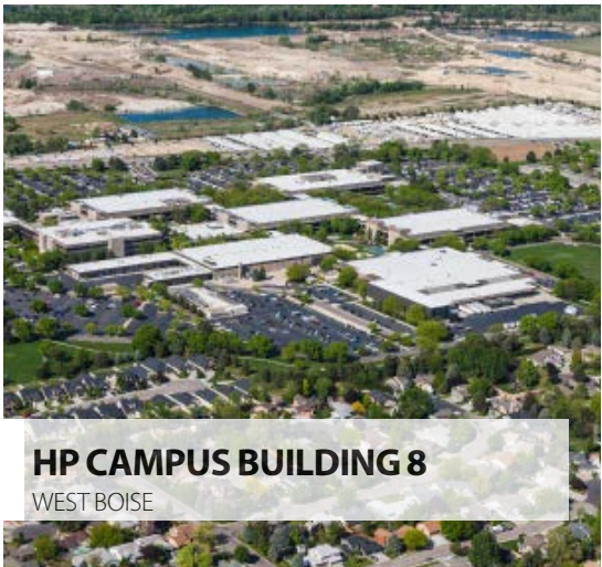
HP CAMPUS BUILDING 8 WEST BOISE

Landlord Representation since 2018 Multi-tenant office building 33,378 SF | 3 stories 15,022 SF leased | 100% occupancy in 2020