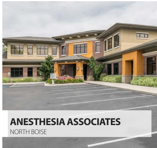
ANESTHESIA ASSOCIATES NORTH BOISE

Tenant Representation Multi-tenant office building 24,742 SF Leased