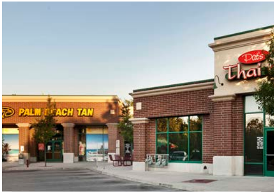
TAOS MOUNTAIN LLC (RAM PLAZA) SOUTHWEST BOISE

Tenant Representation Single Tenant Office Building 35,750 SF Leased