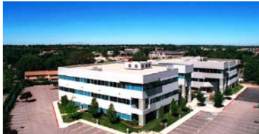
SOLD 63,000 SF Office Buildings