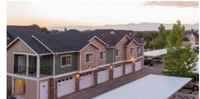
SOLD 171 Unit Apartment Complex