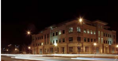
SOLD 71,000 SF Office Building