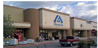
SOLD 20,348 SF Retail Center