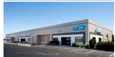
SOLD 76,480 SF Industrial Campus