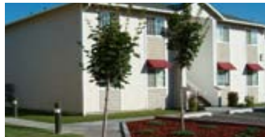
SOLD 157 Unit Apartment Complex