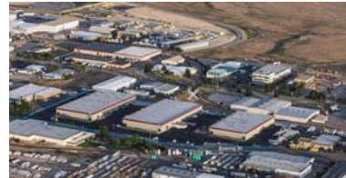
SOLD [3] Industrial Buildings - 170,000 SF