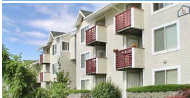
SOLD 280 Unit Apartment Complex