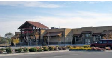
SOLD 71,3200 SF Neighborhood Center