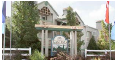
SOLD 300 Unit Apartment Complex