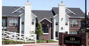
SOLD 288 Unit Apartment Complex