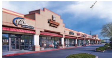
SOLD 68,997 SF Retail Center