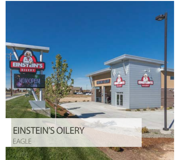
EINSTEIN'S OILERY EAGLE

Landlord Representation 59,839 SF multitenant strip center From 50% vacant to 100% occupied