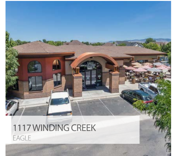
1117 WINDING CREEK EAGLE

Seller Representation Multitenant Retail Strip Center Investment Sale