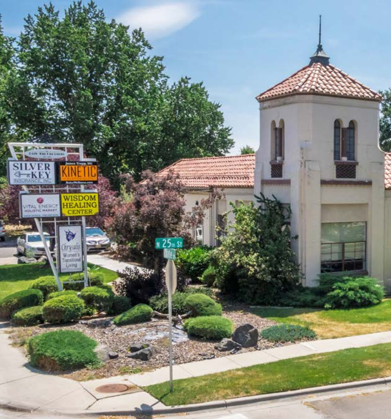
SELLER REPRESENTATION GUERNSEY DAIRY Historic Multitenant Office Investment Closed January 2020