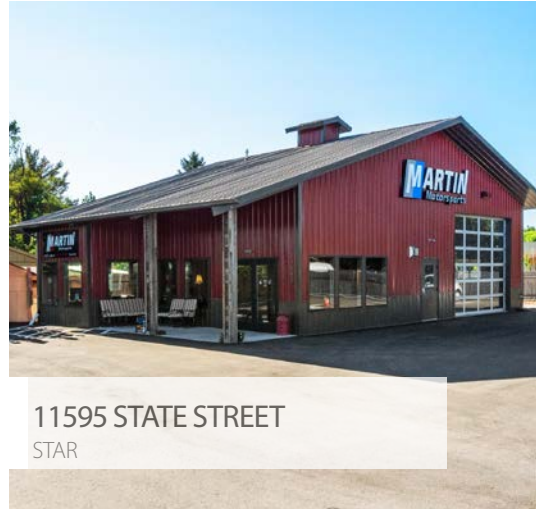
11595 STATE STREET STAR