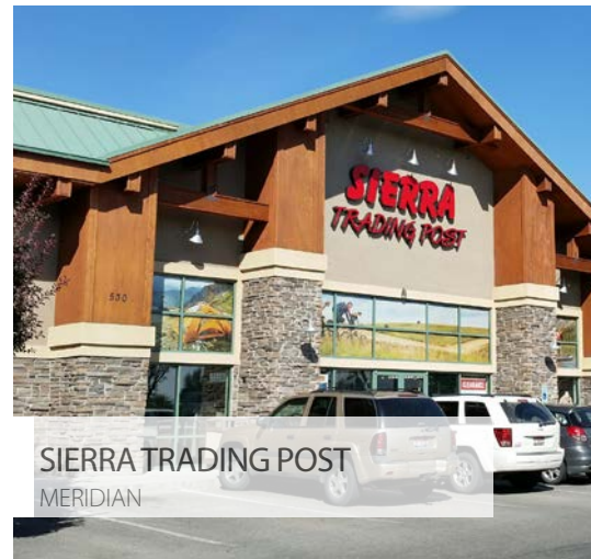
SIERRA TRADING POST MERIDIAN

Seller Representation Multitenant Retail Strip Center Investment Sale