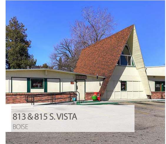
813 & 815 S. VISTA BOISE