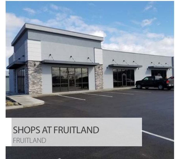
SHOPS AT FRUITLAND FRUITLAND

Landlord Representation 113,970 SF multi-tenant strip center 4 leases | 15,000 SF filled | 85% occupied