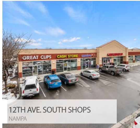
12TH AVE. SOUTH SHOPS NAMPA