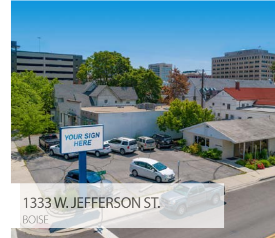
1333 W. JEFFERSON ST. BOISE