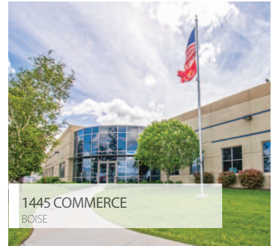
1445 COMMERCE BOISE

152,000 SF | 7 Building Industrial Park Buyer | Landlord Representation March 2018