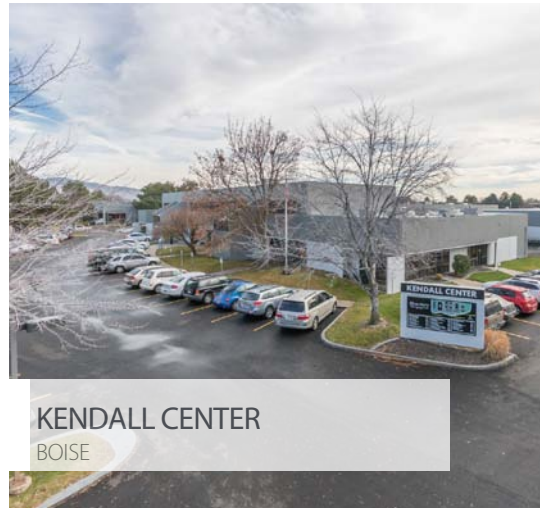
KENDALL CENTER BOISE

47,000 SF Industrial Building Landlord & Tenant Representation April 2019