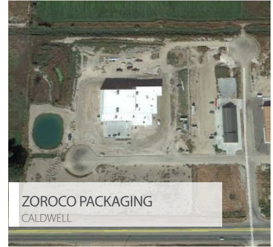
ZORO CO PACKAGING CALDWELL

61,920 SF Industrial Warehouse | Distribution Buyer Representation June 2019