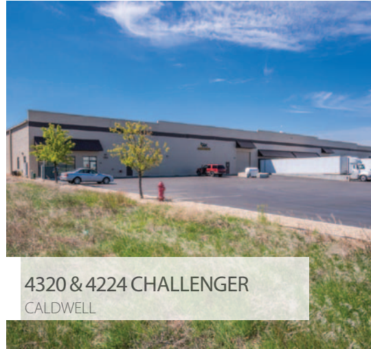
4320 & 4224 CHALLENGER CALDWELL

347,000 SF Industrial Warehouse | Distribution Facility Owner-User Sale and Leaseback June 2019