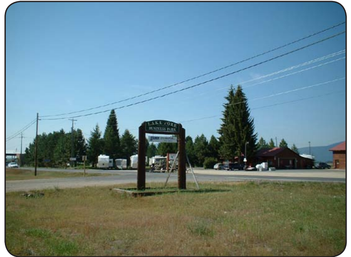
Signage off Highway 55