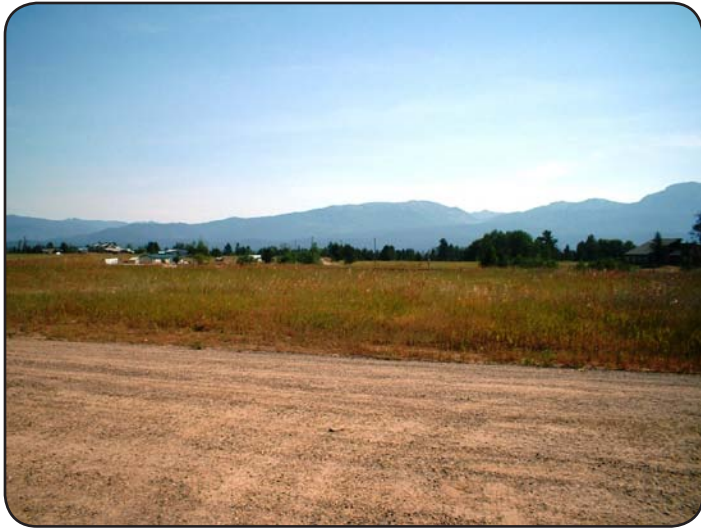
Site looking East