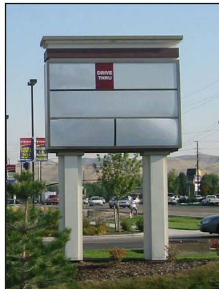
PYLON SIGNAGE - GLENWOOD ST