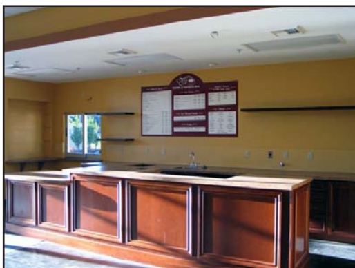
STE 101 - COFFEE SHOP