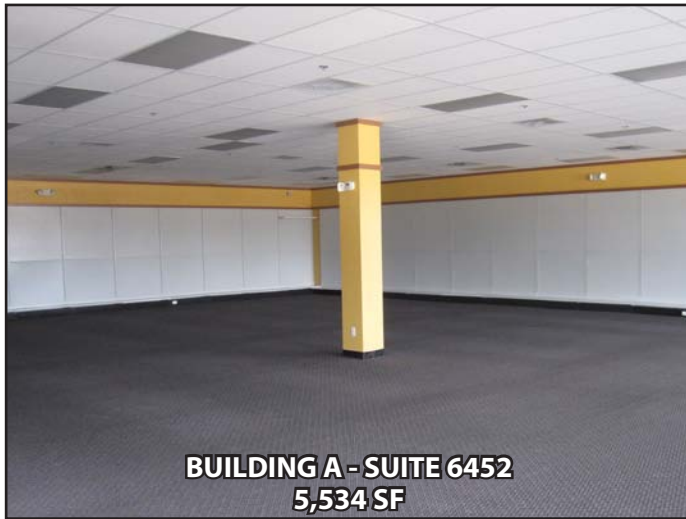
BUILDING A - SUITE 6452 5,534 SF