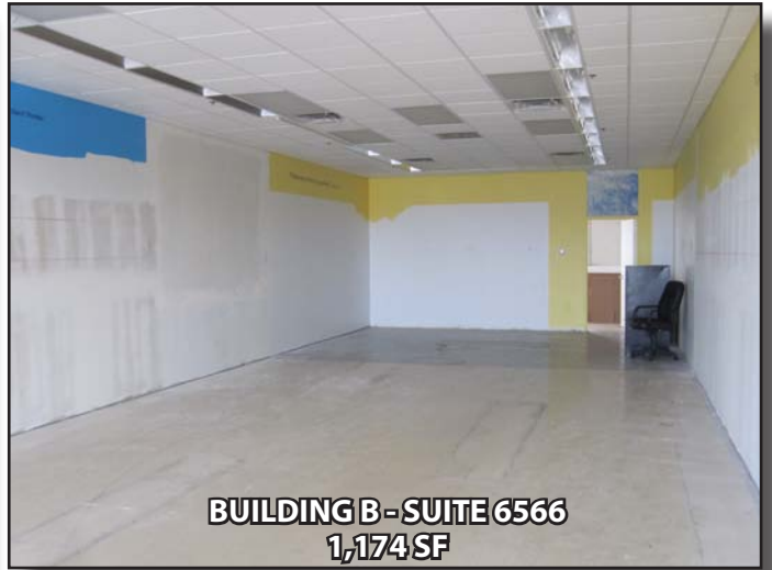
BUILDING B - SUITE 6566 1,174 SF