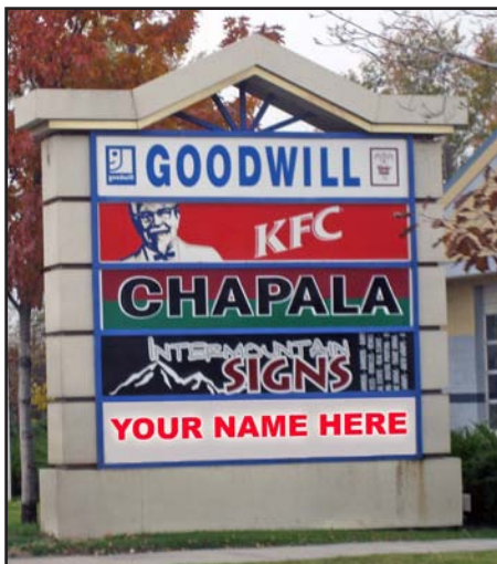
OVERLAND ROAD SIGNAGE