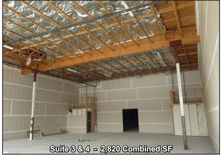
Suite 3 & 4 - 2,820 Combined SF