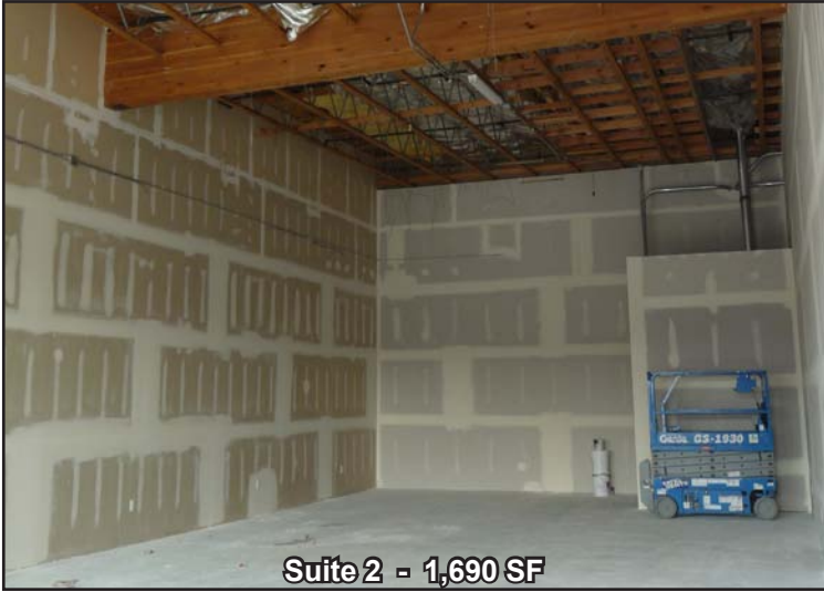
Suite 2 - 1,690 SF