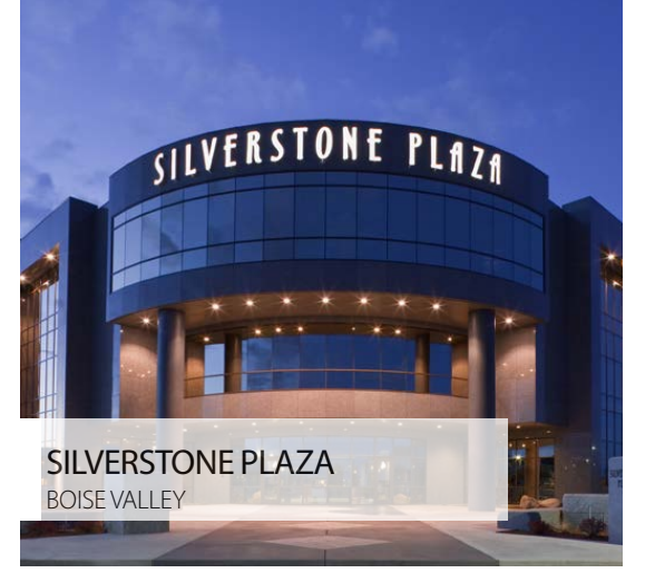
Tenant Representation - 5,941 SF OFFICE