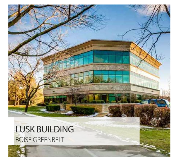
Tenant Representation - 8,897 SF OFFICE

Phone: (208) 947-0802 | nick@tokcommercial.com