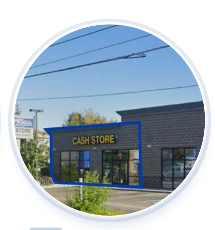
7476 W STATE ST 1,870 SF | RETAIL SPACE FOR LEASE