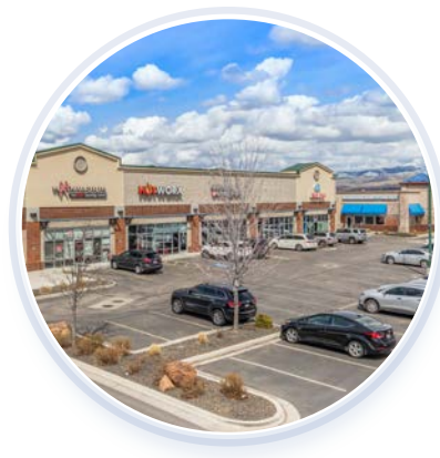
FAMILY CENTER 428,292 SF | RETAIL SPACE FOR LEASE